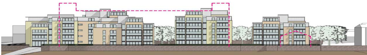
View from the river

Regarding form, the proposed series of buildings in a variety of heights replaces a functionally designed, flat roof former military building with an overall dark brick finish. The buildings are finished in a variety of colours and are of similar height to the existing building, resulting, I consider,