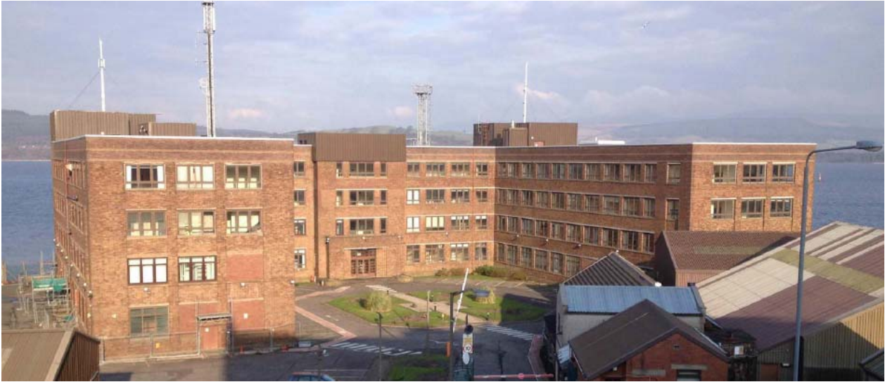
The Navy Building

Impact on the public domain from the scale of the proposed flatted blocks arises on Eldon Street, the Esplanade, Battery Park Avenue and on views from the river. While the proposed blocks are below street level on Eldon Street and their impact is further reduced by the intervening landscaped car park, boundary walling and railings there are modern flats opposite the site, parallel to Eldon Street, fronting Octavia Terrace and at a higher level. These factors reduce the impact of the development's scale upon them.