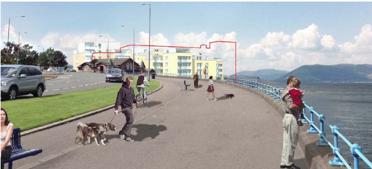
View from Greenock Esplanade

The use of a variety of light coloured facing brick with pale grey coloured cladding at upper levels and the incorporation of large areas of glazing combine, as evidenced by the photomontages accompanying the planning application, also help to minimise the visual impact of the development particularly from the key public views along Greenock Esplanade. While I am content with the generalities of the proposed materials, I consider it prudent to attach a condition reserving their exact colour.