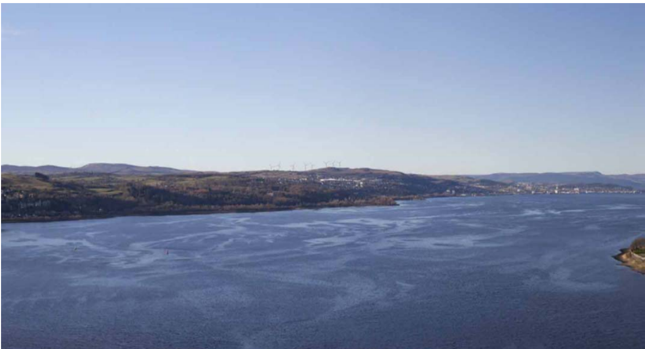
View from Dumbarton Castle

As the applicant has made clear, the attractiveness of this site is its unique wildness in close proximity to towns and villages. The development of an electricity generating station on the site will change the very nature of the experience of the landscape that presently attracts visitors. This attraction is evident from the observations of the Clyde Muirshiel Regional Park Manager and from the public representations. The wind farm experience may prove an attraction to people in itself, but they are becoming more commonplace across Scotland. It is likely that familiarity will decrease the “novelty” value. This contrasts with the volume of objections that refer to the relatively natural appearance of the site as a “draw factor” to recreational users. This will be lost should the proposed development take place. On balance, the Board considers that the area’s value to tourism and recreational use will lose more from the change of landscape character than to be gained from the wind farm “attraction”.