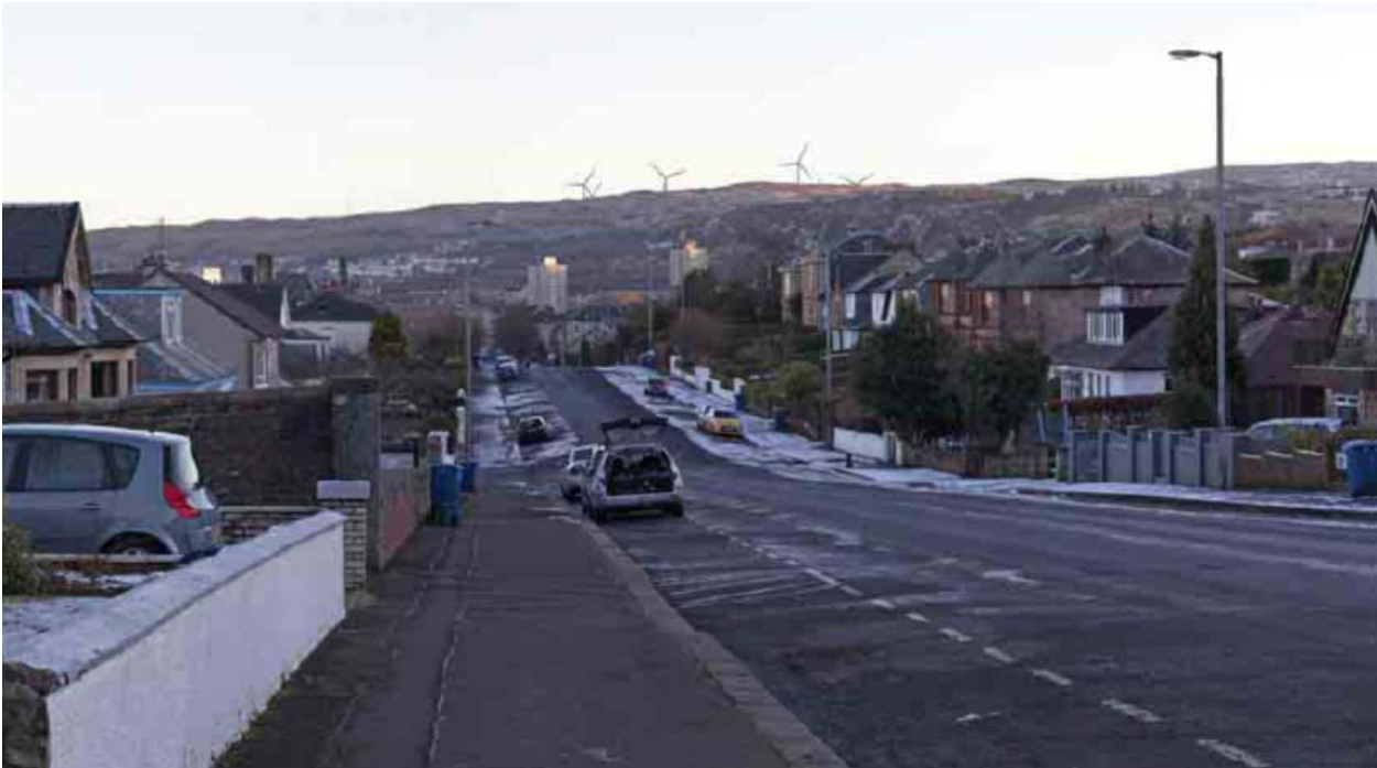
View from Newton Street, Greenock

Whilst the escarpment to the rear of Greenock provides a partially successful visual barrier to views of the proposed wind farm from those parts of Greenock closest to it, many residents within 2km would nevertheless have at least a partial view of a number of the turbines. The wind farm would be substantially visible from parts of Greenock. The applicant, in the environmental statement, lays emphasis on the orientation of “key” windows of houses in Greenock away from the wind farm towards the coastline, and seeks to diminish the significance of the proposal to residents. The Council’s Consultant Landscape Architect considers, however, that “in reality the receptors are the living, moving community whose attention will be drawn to the turbines on top of the hill as they go about their daily routines. Change and impact will be very significant within the communities from which the proposal can be seen from the street or garden.” Furthermore, the Landscape Capacity Study for Wind Turbine Development in Glasgow and the Clyde Valley notes that “groups of people who are most sensitive to their visual environment are usually considered to be residents in their homes and communities, and people accessing the countryside for recreation...” recognising the importance of the mobility of the community in perceptions of views.