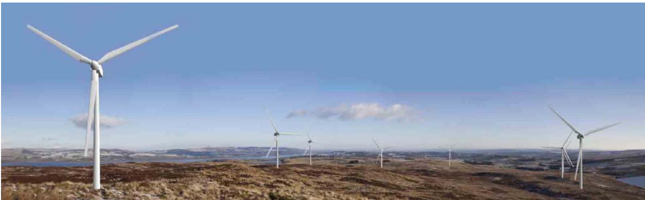
View from Corlic Hill

It is clear from public comment and from the Clyde Muirshiel Regional Park Manager that the application site and the area around it are very popular with walkers and ramblers. Indeed, the applicant's environmental statement makes the point that "this is a uniquely wild part of the Clyde Muirshiel Regional Park: unique in the sense that it is a relatively undisturbed area but is in close proximity and highly accessible to nearby populations." It also points out that "its relative lack of development when compared with the settled landscapes that surround it and its proximity to these areas ensure its popularity with local people for recreation in a landscape where they are able to gain a sense of isolation and experience nature. There is a sense of surprise when one reaches the higher ground that one can "escape" so quickly from the settled landscapes below." Clearly the visual impact of the proposed development on recreational users of this part of the Park merits consideration.