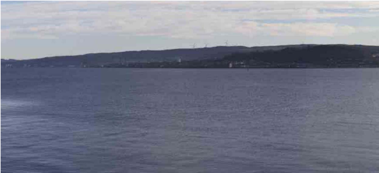
View from Kilcreggan